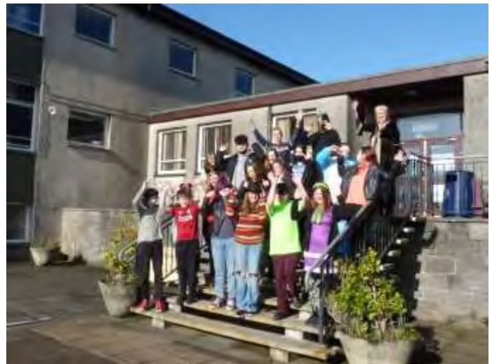
Comic Relief dress up day