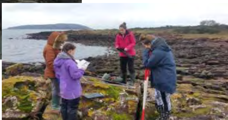
Millport Geography / Biology Residential Field Trip