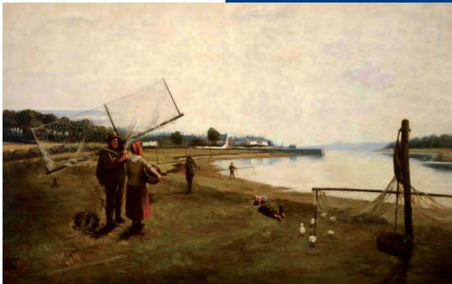
"Haaf-net Fishers near the Solway" by William Ferguson, 1885 (used by permission of Dumfries Museums)

Much of the working population of the village travel to Dumfries and beyond in order to seek employment. A number of businesses, including the hotel, the shop and a variety of trades businesses provide local employment, however the availability of further local employment and affordable housing is limited. Ample local employment and affordable housing for locals is a crucial requirement for the wellbeing of Glencaple. The need to maintain the school roll and to ensure the continuation of vital services such as the hotel, shop/post office and local bus services etc is a critical need. The Local Development Plan recognizes the need for affordable housing and the development proposals for these sites should include an element of affordable housing for local people. There may be scope to increase local economic activity through, for example, increased tourism (perhaps through an increase in bed and breakfast provision or through increased and appropriate home-working). The potential for the re-use of existing redundant buildings is generally to be encouraged, unless their re-use would constitute 'bad neighbour' or other problematic