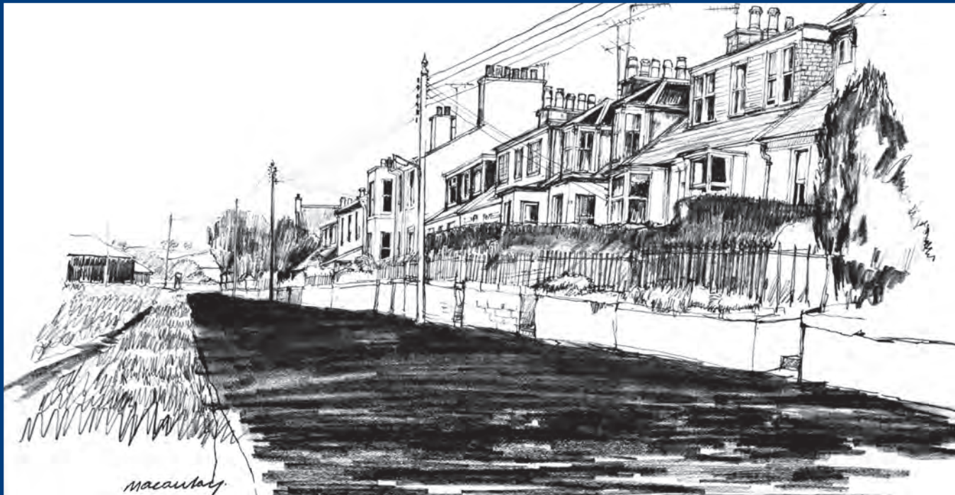
Illustration by James McAulay (used by permission of Hugh Bryden)